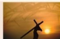
Holy Land Collection

Good Friday, April 7th 7:15am Morning Prayer 3:00pm Good Friday Service 8:00pm Tenebrae Service