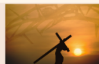
Holy Land Collection

Good Friday, April 7th 7:15am Morning Prayer 3:00pm Good Friday Service 8:00pm Tenebrae Service