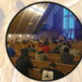
Prayer, Adoration, Confession

NET Retreats are a powerful opportunity for middle and high school youth to encounter Christ. Teens may choose to attend either day of the Retreat.