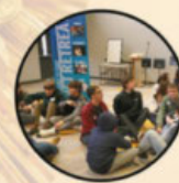
Large group and small group discussions