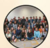
Meet Catholic teens from multiple Parishes