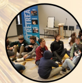
Large group and small group discussions