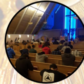
Prayer, Adoration, Confession

NET Retreats are a powerful opportunity for middle and high school youth to encounter Christ. Teens may choose to attend either day of the Retreat.