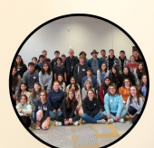
Meet Catholic teens from multiple Parishes