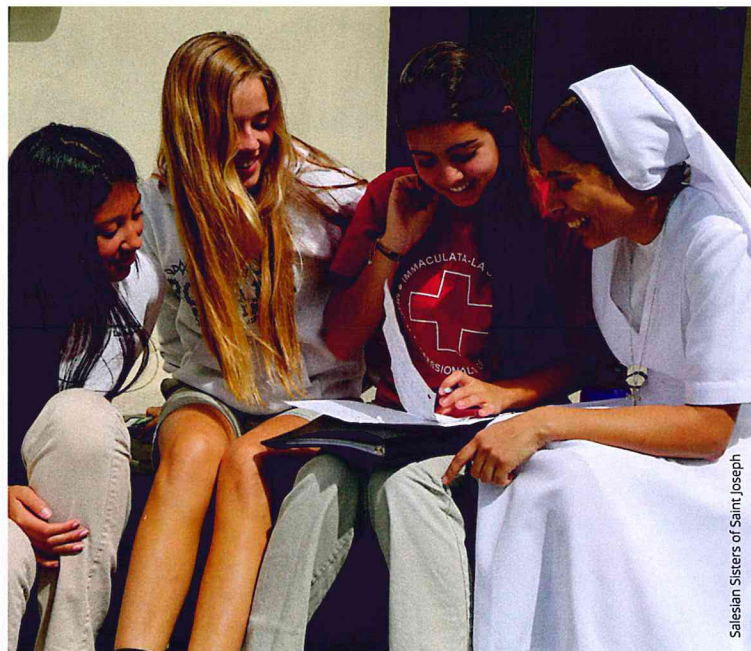
Salesian Sisters of Saint Joseph

Note that none of these involve phones or social media. How can you organize real-life activities for youth in your parish?