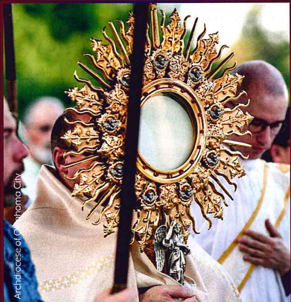
Archdiocese of Oklahoma City

As the Church prepares for this historic event, let's ask our Eucharistic Lord for an outpouring of vocations!