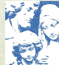
Holy Family Catholic School

The Catholic schools in our diocese provide children not only good education, but also teach the faith. Catholic schools throughout the Diocese of Pueblo are partly supported in their ministry and education of children through the AMD.